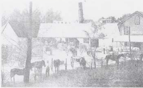
During its heyday, as shown in this undated photograph, Hopkins & Bro. Store served as the interconnection between the productive farmlands of the Eastern Shore and the commercial markets along the Chesapeake and Atlantic Coasts.