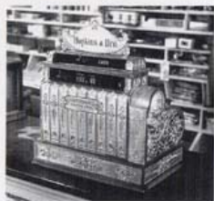
"Gold" cash register at Hopkins & Bro. Store.

During its November meeting, the Board adopted easement language to protect the character defining features and uses of the structure regardless of future ownership. The board of the Virginia Department of Historic Resources accepted the concepts of those easements,