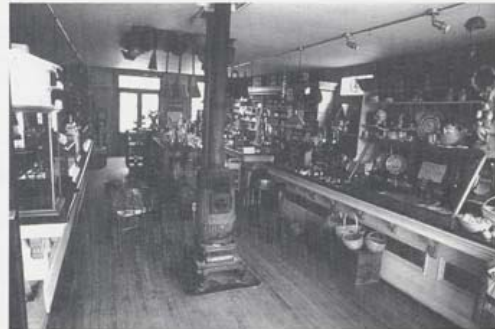
For the past two decades, the APVA sought tenants to operate Hopkins & Bro. Store as an active part of the community. This photo shows the interior of the Store at one point when the tenant sold various goods to customers.