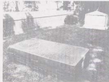
Allowing one of our properties to leave our direct management is never an easy decision and not one made lightly. During the past several years, we have transferred properties successfully to other ownerships, such as the Custis Tombs (top), the Adam Craig House (below), the Old Tobacco Warehouse, and the row houses on 19th Street (l.) in Richmond—all used actively and productively in the private sector.

The Custis Tombs (1696) in Northampton County are now part of the Arlington Foundation. The Ball Cemetery (1837) in Loudoun County is under the care of a newly created family association. The Old Tobacco Warehouse (1760) in Urbanna is now owned and being renovated by the Town. The Adam Craig House (1785) and the row houses (19th c.) on 19th Street in Richmond are now used actively and productively in the private sector. All of these properties are no less important or cared for less. In truth, most are receiving more attention than we could provide when they were part of our large portfolio of statewide properties.